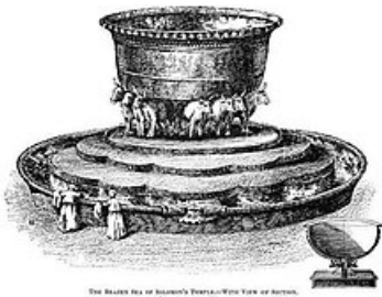
An artist's rendition of the Molten Sea

Also he made the cast metal sea, ten cubits from brim to brim, circular in form, and its height was five cubits and its circumference thirty cubits.