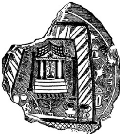
Image of a 3rd-century (AD) glass bowl which depicts Solomon's Temple . Boaz and Jachin are the detached black pillars shown on either side of the entrance steps.

the two pillars, the bowls and the two capitals on top of the pillars, and the two networks to cover the two bowls of the capitals which were on top of the pillars - Two pillars - see Jachin and Boaz