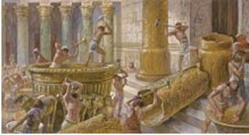
The Brazen Sea is destroyed by the Chaldeans (watercolor, circa 1896–1902 by James Tissot, or followers)